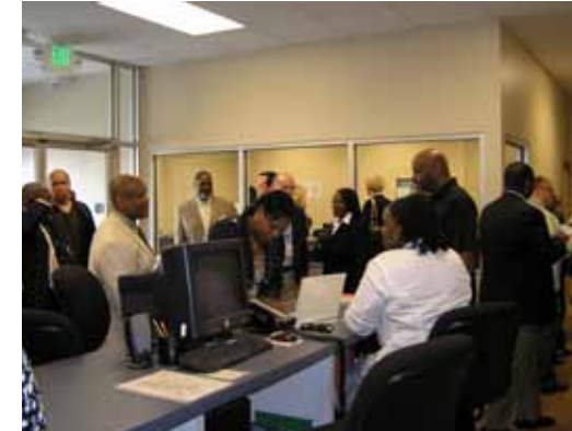
A view from the Front Desk in the NRRC Lobby and Reception Area as guests arrive for the Open House.