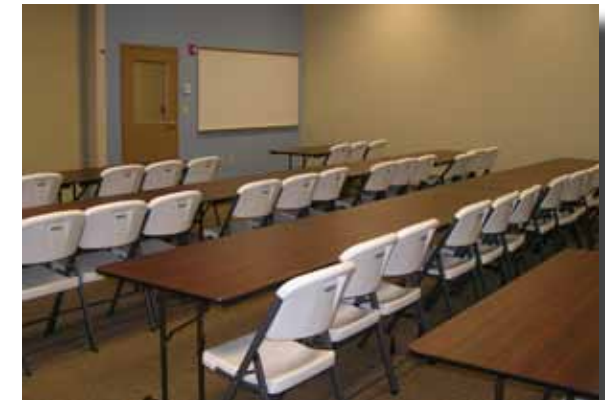
Events and classes can be held in the Large Classroom. The classroom can accommodate up to 100 people with chairs only and 50-60 with chairs and tables.