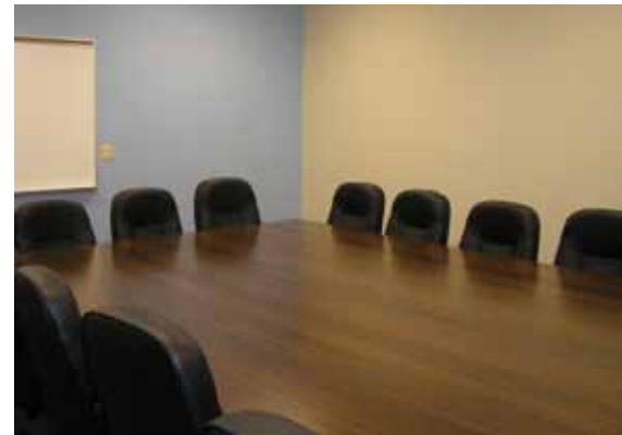
The Conference Room at North Star Neighborhood Reentry Resource Center is available for Community Meetings.