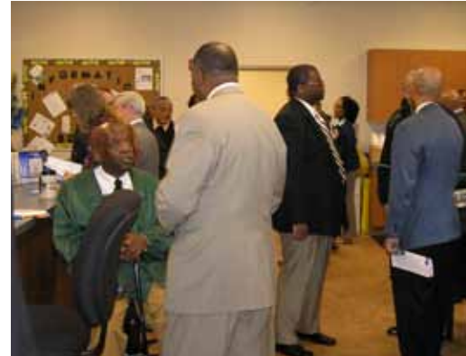
The Reception Area at North Star Neighborhood Reentry Resource Center