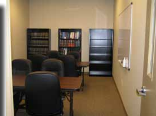
The Library is available for reading and quiet study. A number of books have been donated from area libraries and the collection includes a set of the Ohio Revised Code law books.