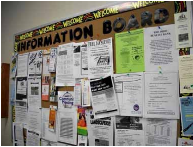
Information is Here at North Star